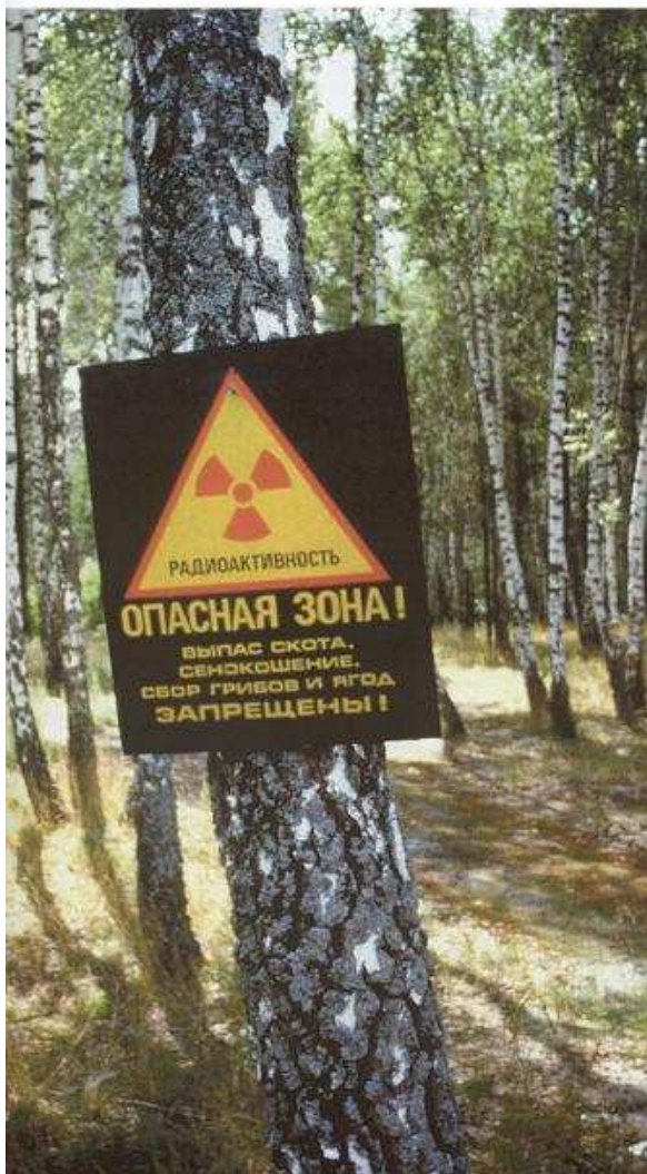
Forest near Chernobyl, "Danger, contaminated area, forbidden to pick berries, mushrooms and to shepherd animals"

Aren't many going to die if the Technosystem is dismantled? Yes, if you really care about numbers bear in mind that the more technology expands the more population will increase and with it the chances and catastrophic consequences of collapse. If the system collapses in two hundred years more people will die than if it collapsed now as population will continue to grow.