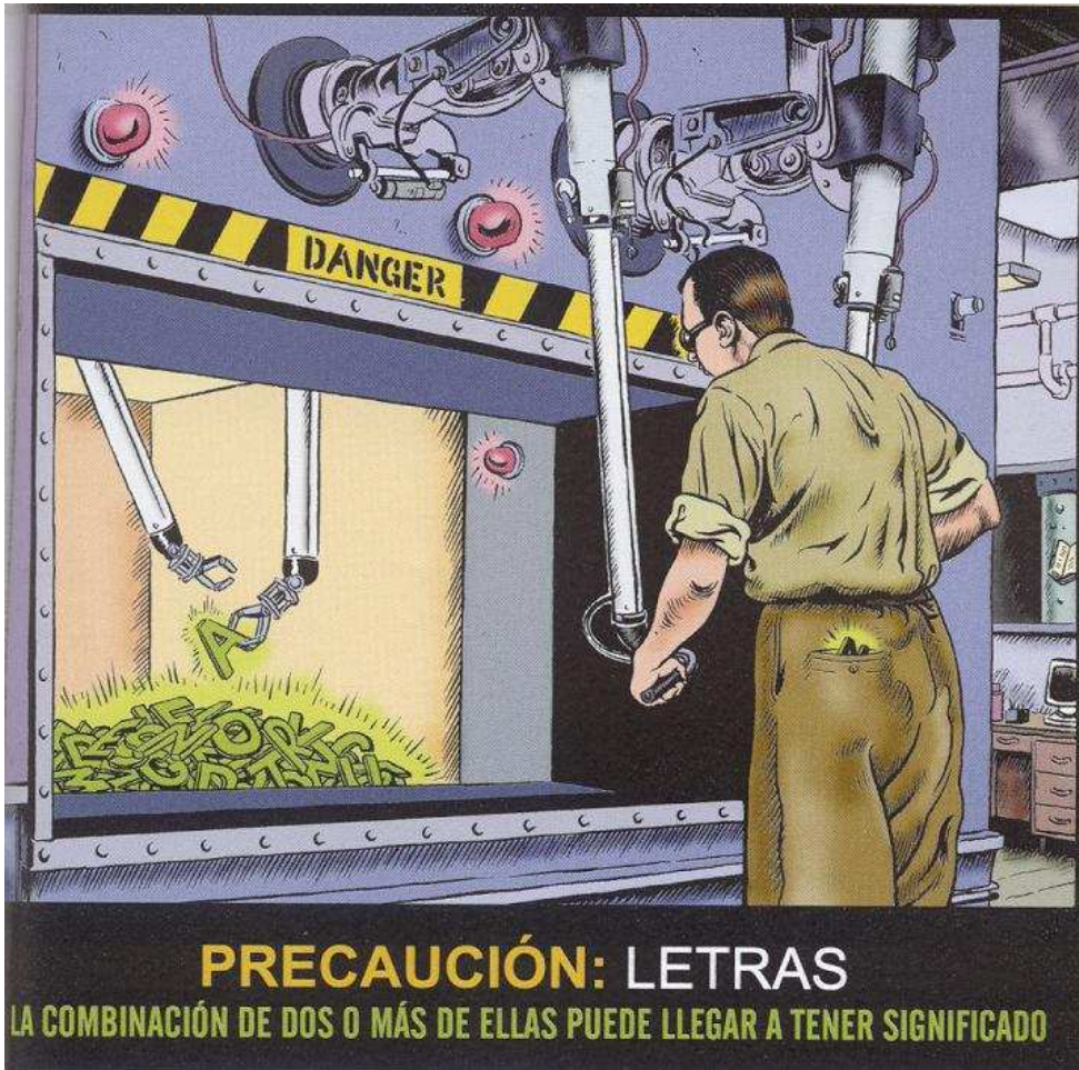
Comic strip translation: Warning: letters, combination of two or more of them can have a meaning