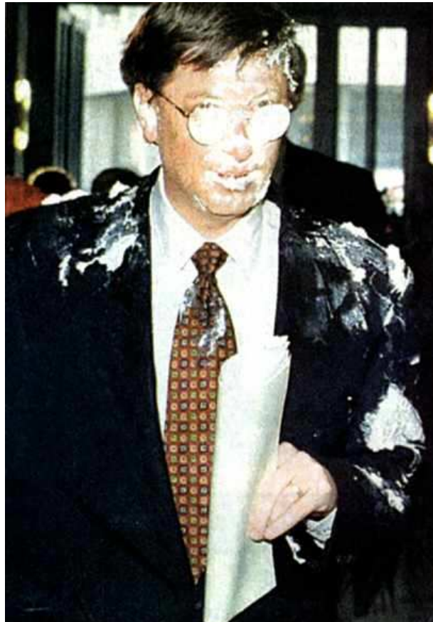
Bill Gates getting hit by a cake after a meeting.

For discussing the access to large amounts of information part we would like to invite people to think about the latest educational trends to substitute books by computers. Without going into a debate about the terrible effects on the ability of understanding that such foolishness will lead in young students and to avoid extending too much on the subject we will comment only what follows: it is extraordinarily difficult to scrutinize the world in search of each copy, for example of history, and change