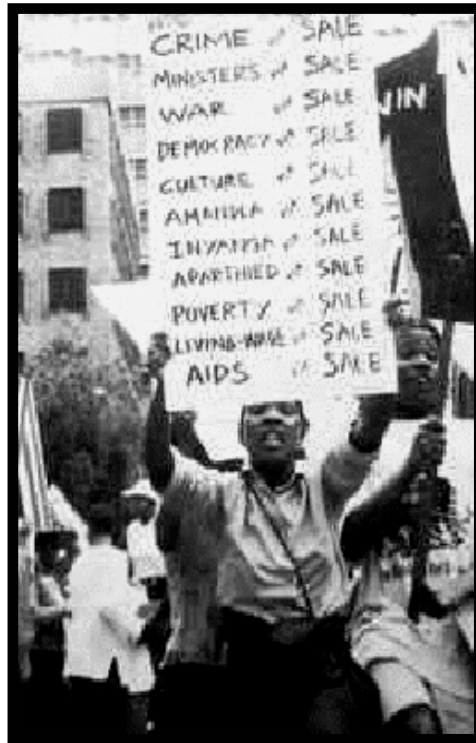
CLEARANCE SALE IN PRESENT-DAY S. AFRICA: Protest modern-day style. 15 years ago the commodity and commodity relations encompassing the virtual totality of everyday life would never have been so emphasised in South Africa where everything from, culture, crime, democracy to apartheid is now merely a marketable item.

So, while most of the wealth still remains firmly in white hands, the optimistic black middle class, undisturbed by visible proletarian subversion, can claim “rich people have worked hard for their money, it wouldn’t be fair to take it away from them” ( Guardian , 25/5/04). At the same time, those rich white supporters of apartheid who fled the country 10 years ago are now being encouraged to come back – all is forgiven: advertisements on satellite television will be backed later this year by an international road-show of seminars and exhibitions urging expatriates to return to a land of sunshine and opportunity, as part of the “Homecoming Revolution,” sponsored by the First National Bank. As Pamela Cox, former Head of the South Africa