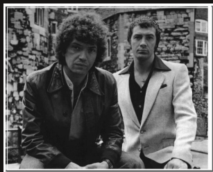
Thames Televisions 1980's fictional Spy's: "The Professionals" - disadvantaged by both available technology and dress sense

Clearly, unless you belonged to subversive organisation like the NUM or CND you probably were not being surveilled at the time by the security services, half of whom seemed to have been Oxbridge-educated Soviet agents anyway. The technology didn't exist for them to casually observe you, well maybe you - but not all of you- they had to "bug" you - physically putting a listening device in your telephone (how quaint) or actually follow you about, or sit outside your house in a British Telecom van, continuously smoking Embassy No.1's in skin tight jeans with some headphones on over their permed hair. Or at least that's how it was done in the 1980's Thames Television program "The Professionals".