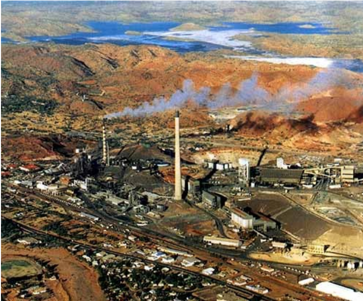
Industrial copper strip-mining = not green!

industrial mining of copper- a very rare metal- is an astonishingly destructive and difficult process. The barren wastelands that result from this process are not green, and solar panels require the existence of such wastelands. Readers are free to draw their own conclusions from these premises.